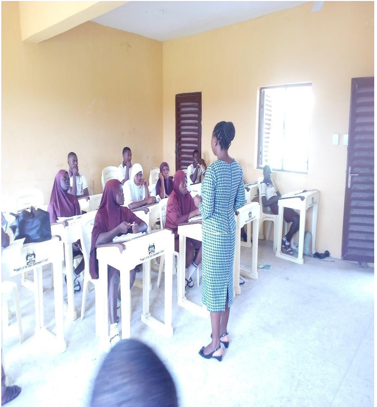
A FOCUS GROUP DISCUSSION SECTION WITH STUDENTS OF TIMI AGBALE HIGH SCHOOL, EDE