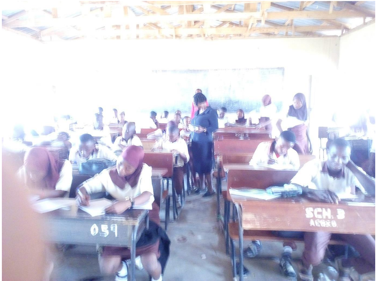
STUDENTS OF ST MARK'S ANGLICAN SCHOOL, OSOGBO COMPLETING THE QUESTIONNAIRE