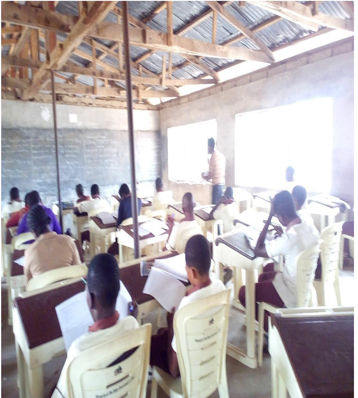
A RESEARCH ASSISTANT INSTRUCTING STUDENTS OF LOCAL AUTHORITY HIGH SCHOOL, IPETUMODU ON HOW TO COMPLETE THE QUESTIONNAIRE.