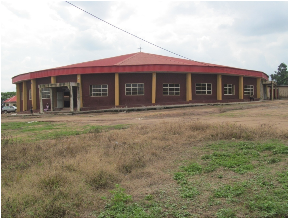
PLATE 8. This is the front view of 55 square meters Sacred Place of Prayer Building at Banke-Essa Village, Odo-Omi, Olodo, Ibadan.