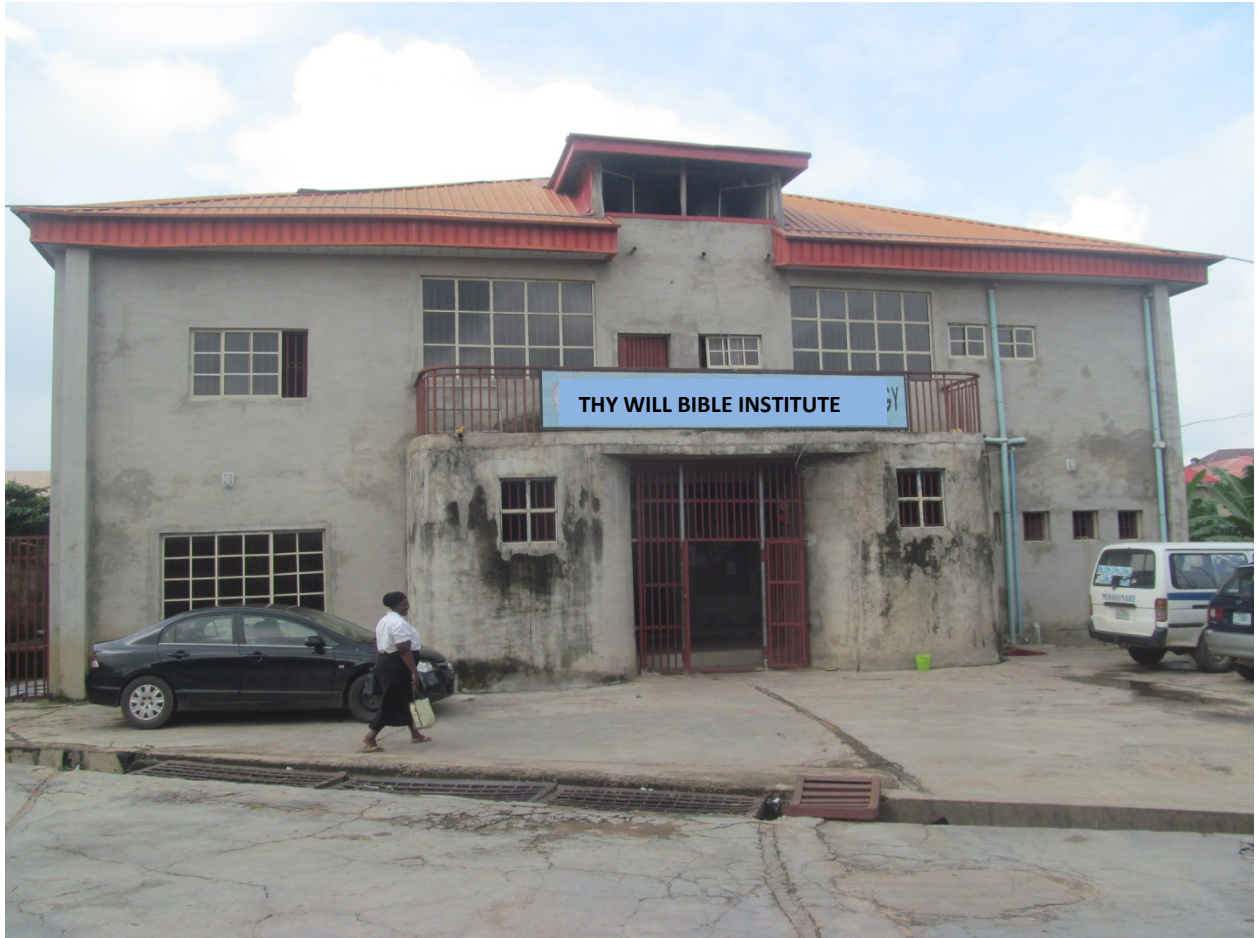
PLATE 7. This is the front view picture of Thy Will Bible Institute of Theology, Religious and Ministerial Studies, Ashi, Ibadan.