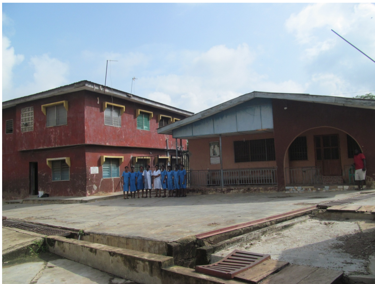
PLATE 9. This is the front view of C.A.C. Oke-Agbara Mid-wifery Center with mid-wives at Ashi. Ibadan.

The above table shows that 543 with 95.8% respondents agreed while those that disagreed are 24 constituting 4.3% that Prophet M.O Olowere employed women ministers in the expansion of Christ Apostolic Church in Ibadanland.