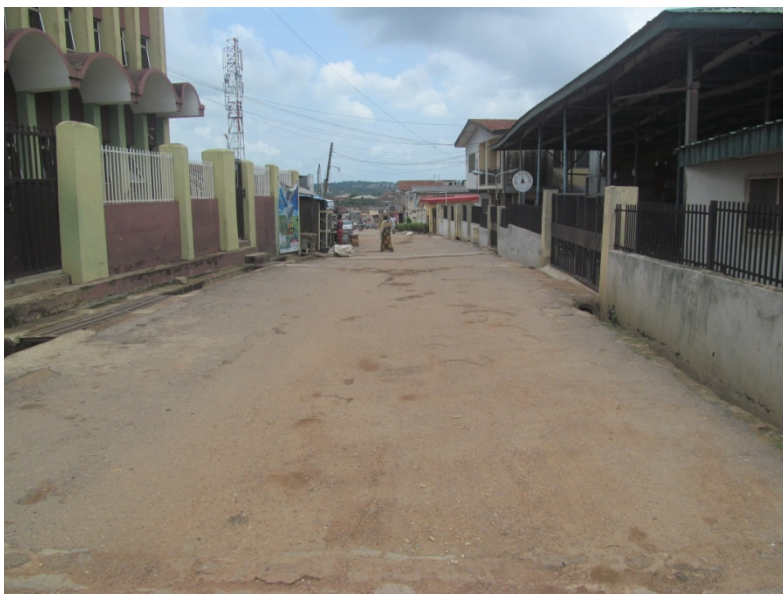
PLATE 10. This is the picture of access road between C.A.C. Oke-Imole DCC premises and Iwo-Road/Ojo Express road, Ibadan constructed by Prophet Michael Olowere.