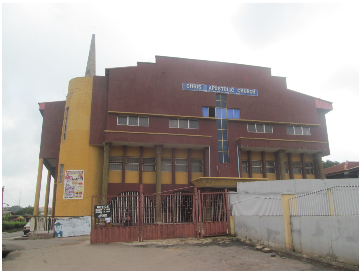
PLATE 3. This is the front view picture of C.A.C. Oke-Agbara District Headquarters, Ashi, Ibadan.