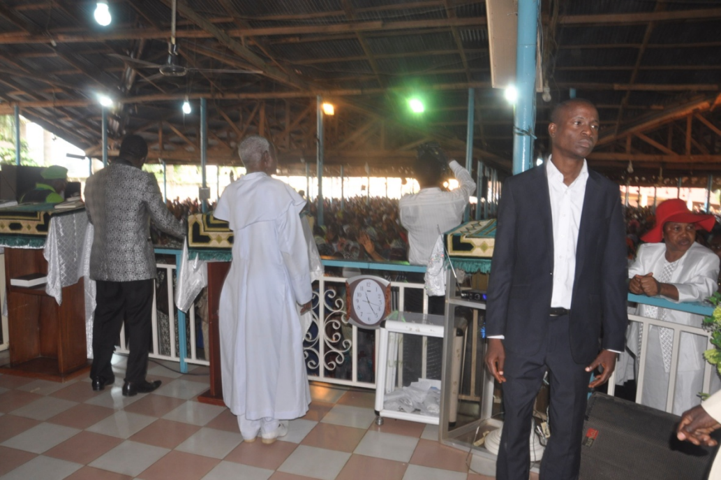
Plate 5: Picture showing Automatic Prayer Automatic Answer Programme at CAC Oke Agbara Ashi, Ibadan.

The above table shows that 557 with 98.20% respondents agreed while 10 with 1.8% respondents disagreed that, Automatic Prayer Bulletin contributed to the expansion of the church.