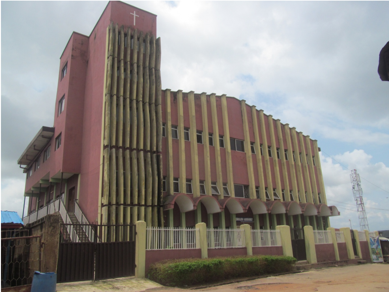
PLATE 2. This is the picture of C.A.C. Oke-Imole DCC Headquarters, Agbowo, Ibadan.