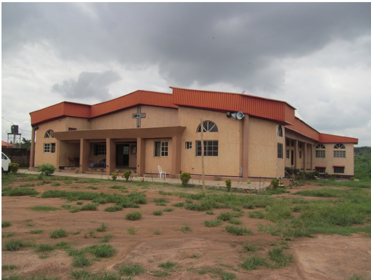
PLATE 4. This is the front view picture of C.A.C. Oke-Agbara, Monatan District Headquarters, Iwo-Road, Ibadan.